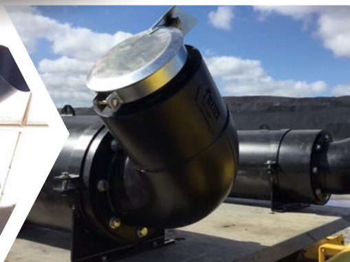
Protect your crew from extreme exhaust burns with reduced surface temperatures