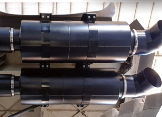
Dual-wall exhaust upgrades remove the need for thermal blankets on engine pipes