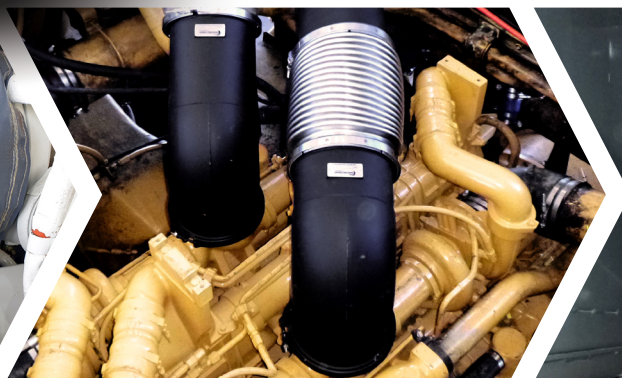
Exhausts bolt onto turbo outlets, pipes swappable with OEM components