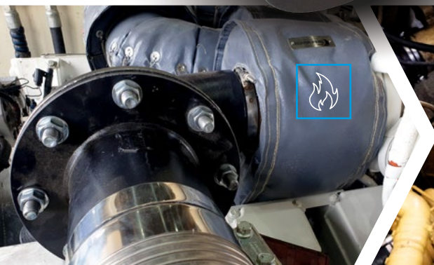
Mitigate the risk of engine fires by adding thermal blankets to critical heat components

*Note: Exhausts supplied in Aletek's Gunmetal Grey