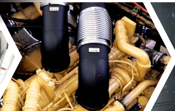
Exhausts bolt onto turbo outlets, pipes swappable with OEM components