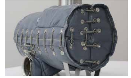
Thermal insulation blanket upgrades available for fire mitigation