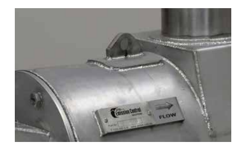
Heavy duty stainless steel construction for extended product lifecycle