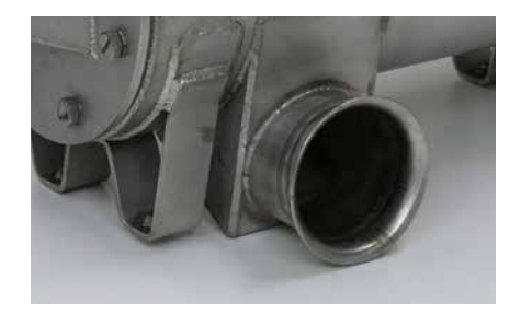
Designed for in-line replacement and integration with existing exhaust system