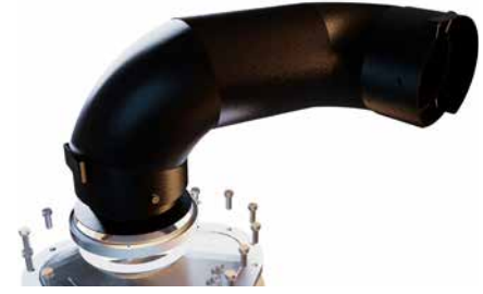
Custom pipe fabrication to integrate with the OEM engine pipe configuration