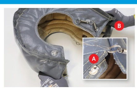
TURBOS Feed wire through spring keyring to work as a pull-wire (A). Open turbo shell (B). Slide blanket over turbo. Pat blanket to fit shape. Ensure oil line is outside the blanket to prevent overheating and oil line damage (C).