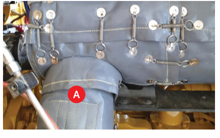
MUFFLERS Open blanket and wrap around muffler. Connect springs to anchors. Ensure inlet flange is installed over engine pipe cover (A). Massage blanket to final shape for best coverage.