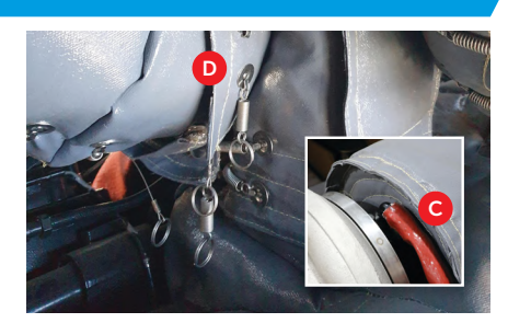
Connect springs on blanket. Remove pullwire from keyring. Ensure blanket mates to manifold blanket, maximise coverage. Pat blanket into position. If the outlet flange cover is fitted ensure this section is outside engine pipe blankets (D).