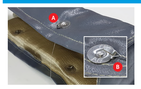
MANIFOLDS Attach tie wire end to anchor (A). Hold blanket against manifold. Feed wire behind manifold cylinder runners. Massage blanket to final shape. Loop wire around anchor, connect springs to anchors (B).