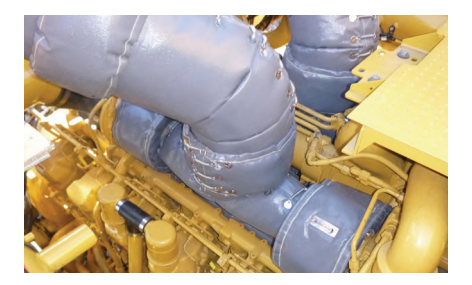
JUNCTIONS Open blanket and wrap around junction. Connect centre spring and work outwards connecting springs. Massage blanket to final shape for best coverage.