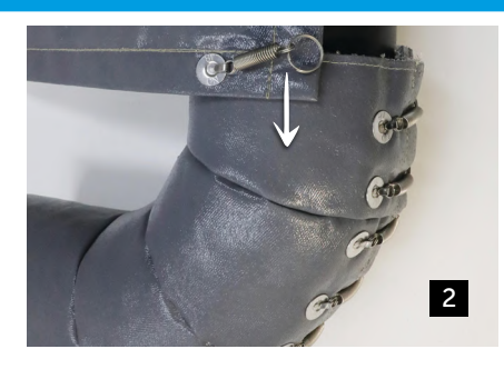
OVERLAPPING SECTIONS Blanket pieces should be fitted to overlap those in a position prone to gravity effects. This ensures liquids/fluid/debris runs off to remove seepage and potential ignition.