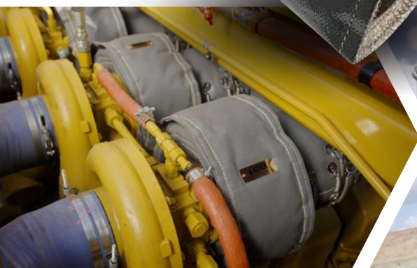
Turbo and manifold insulation is critical, define an insulation spec for assets