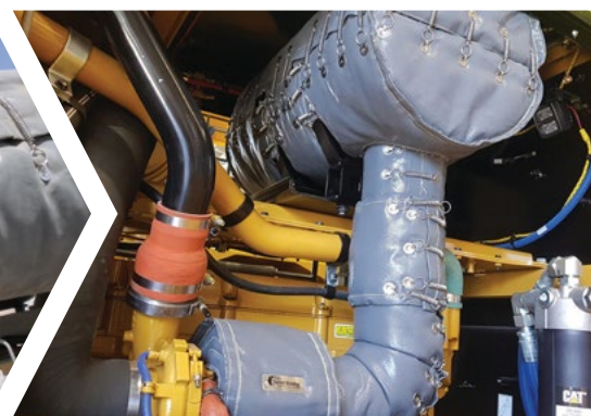
Blanket kits in stock for dozers, drills, excavators, graders, loaders, trucks and more