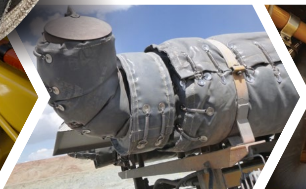
Protect your crew and extreme-heat sensitive components like wire cables