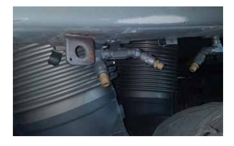
Competitive pricing compared to OEM products with long-term cost savings