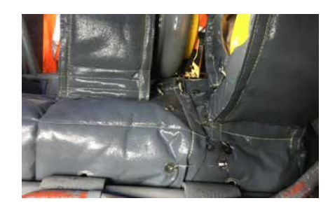
Mitigate the risk of engine fires by adding blankets to heat critical components