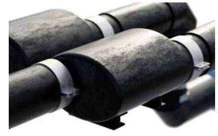
Compatible with OEM parts and backed by our Direct-Fit Replacement Guarantee