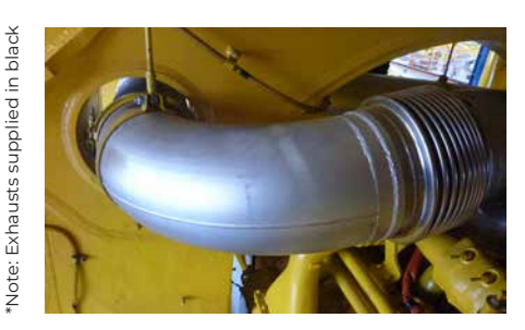
Competitive pricing compared to OEM products with long-term cost savings