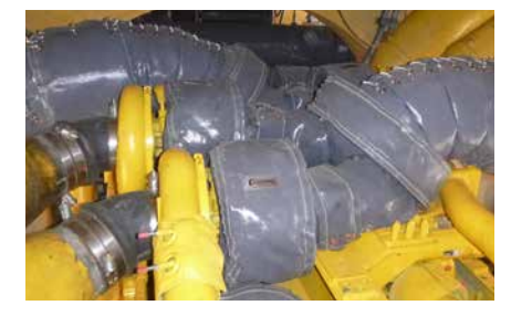
Mitigate the risk of engine fires by adding blankets to critical heat components